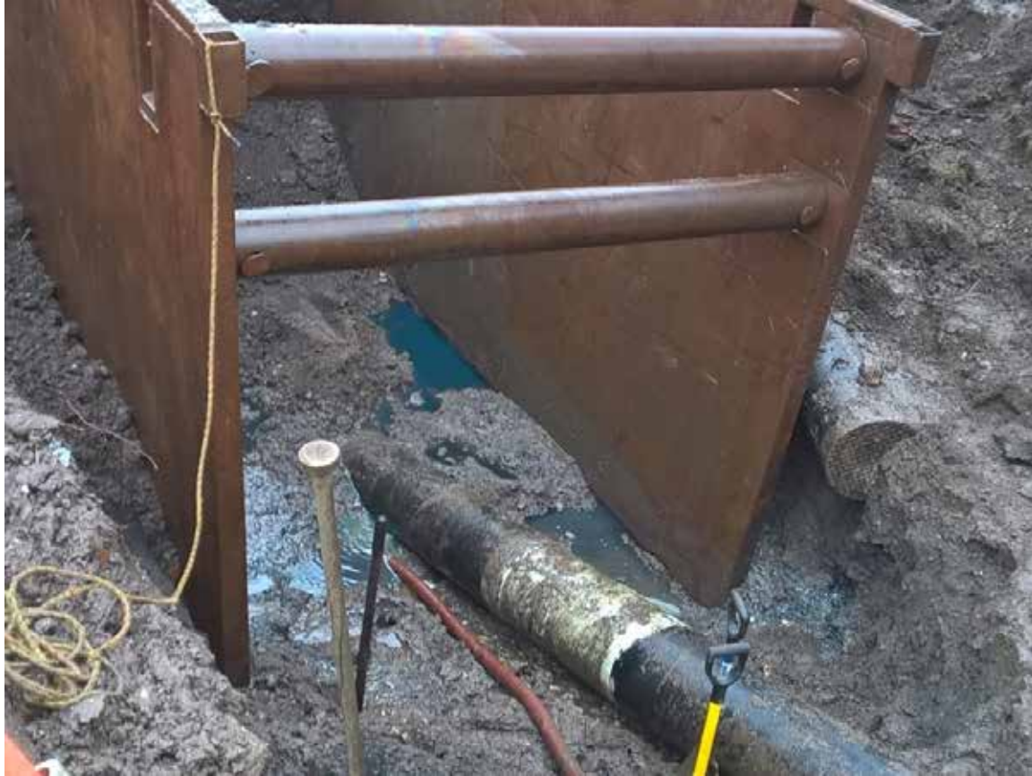
IMTT Pipeline leak