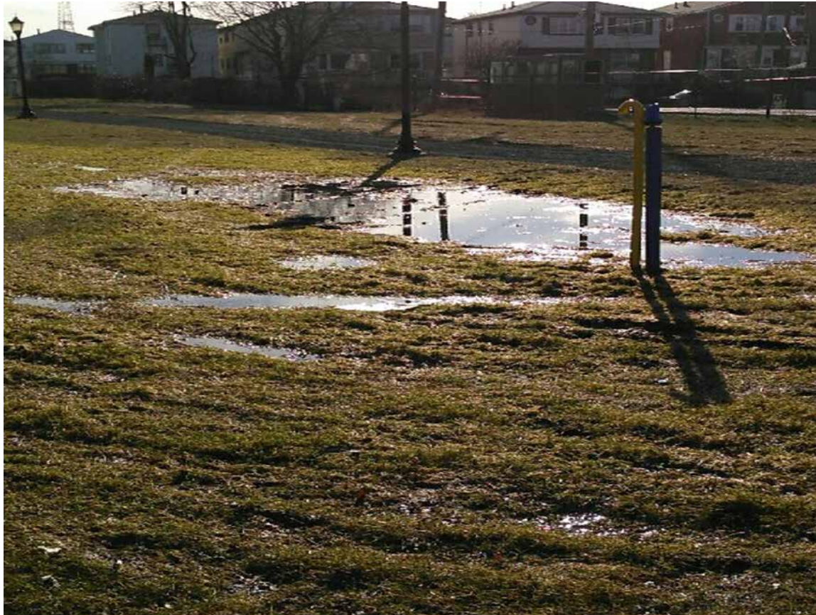
February 22 nd IMTT Pipeline leak