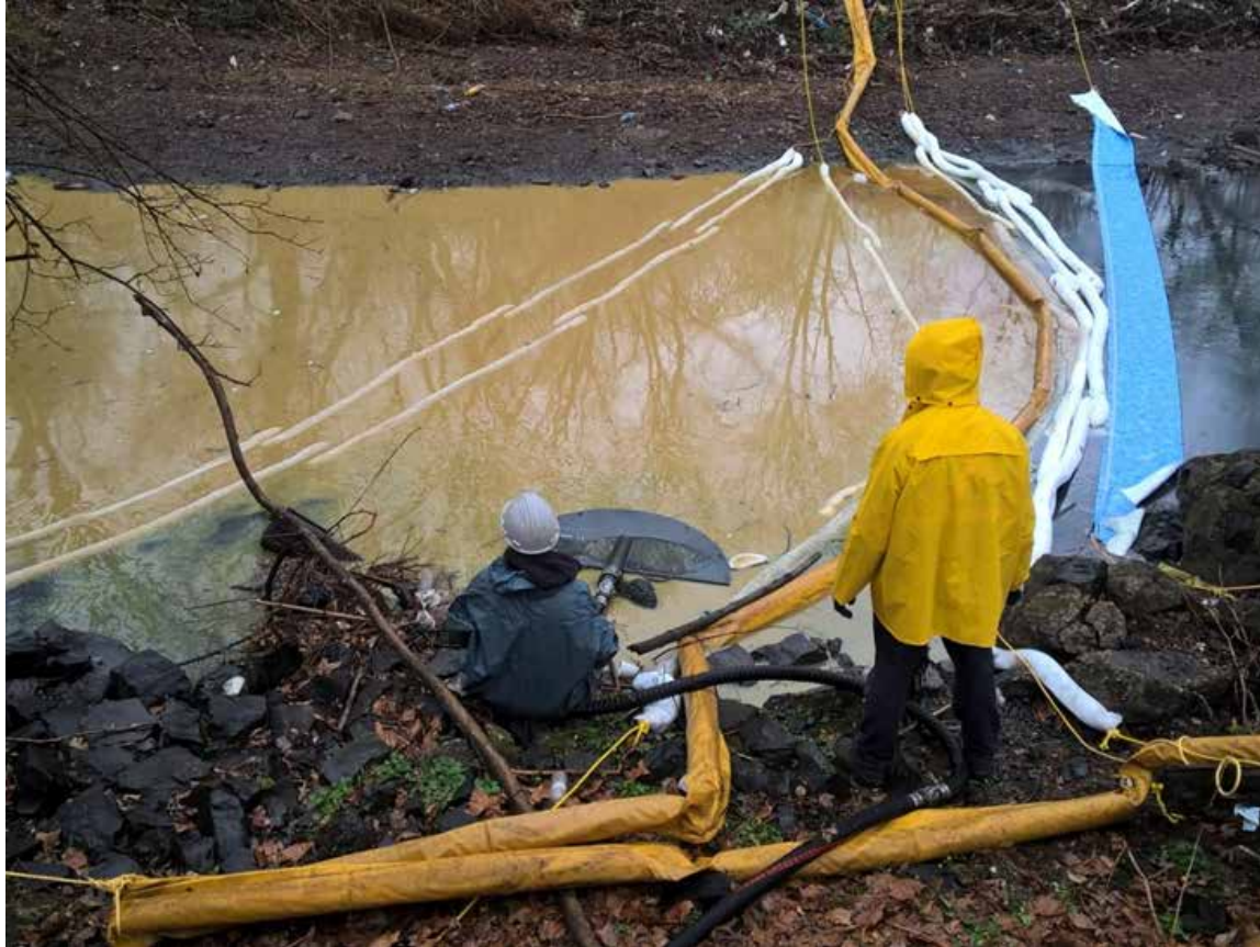
Manya skimmer on the Elizabeth River