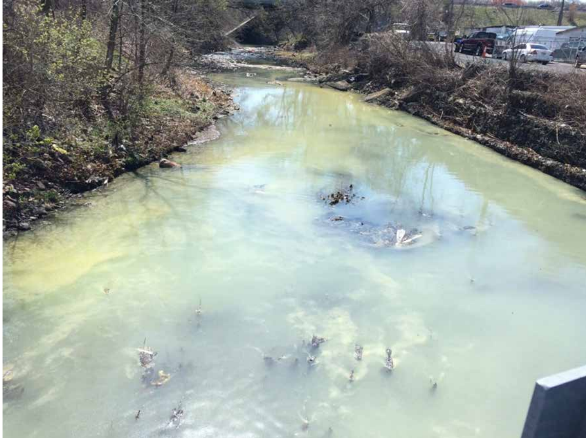
Elizabeth River Irvington