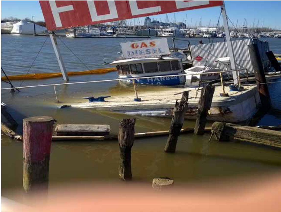
Sunken Fuel Barge Jersey City