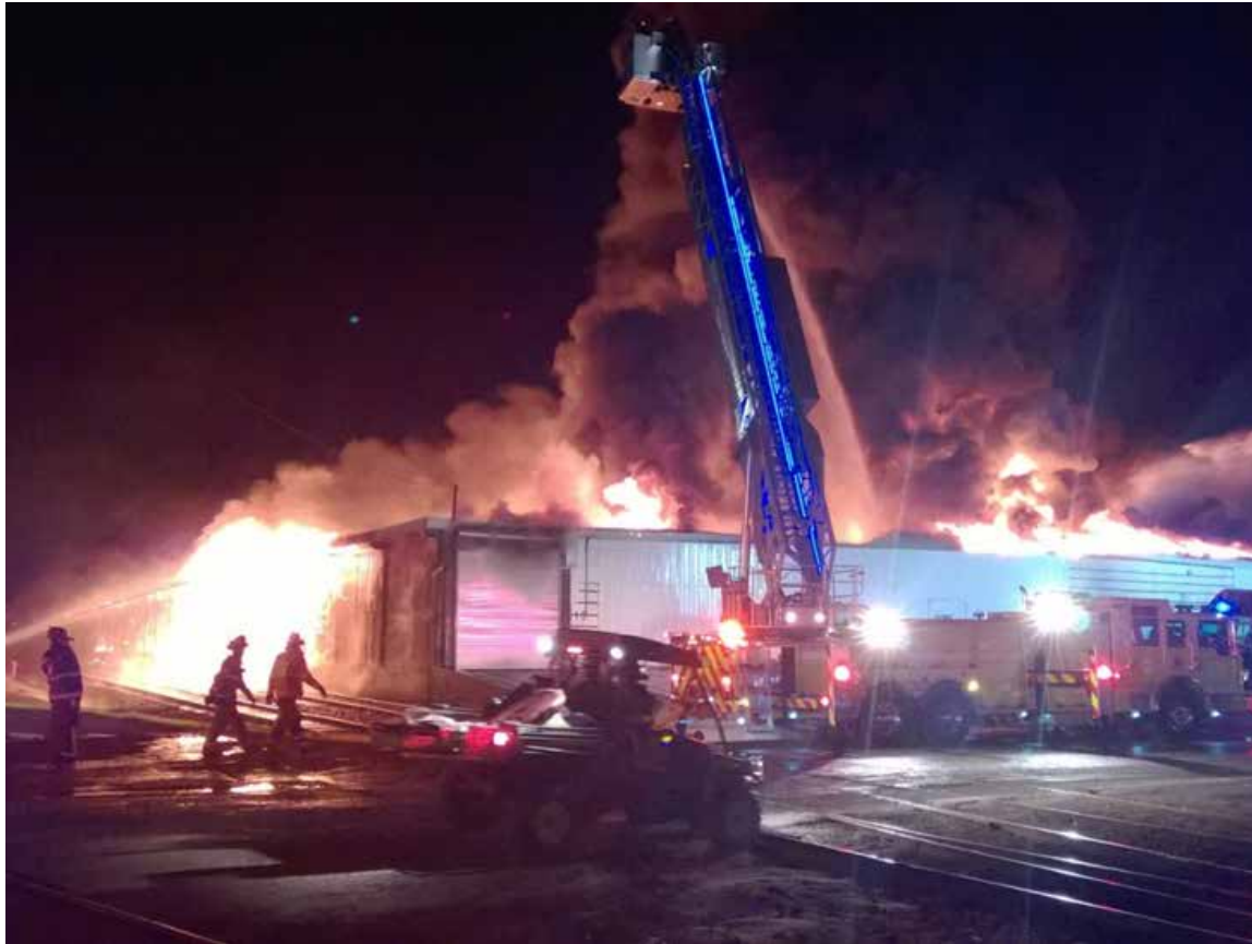
February 18 th Hillsborough Warehouse Fire