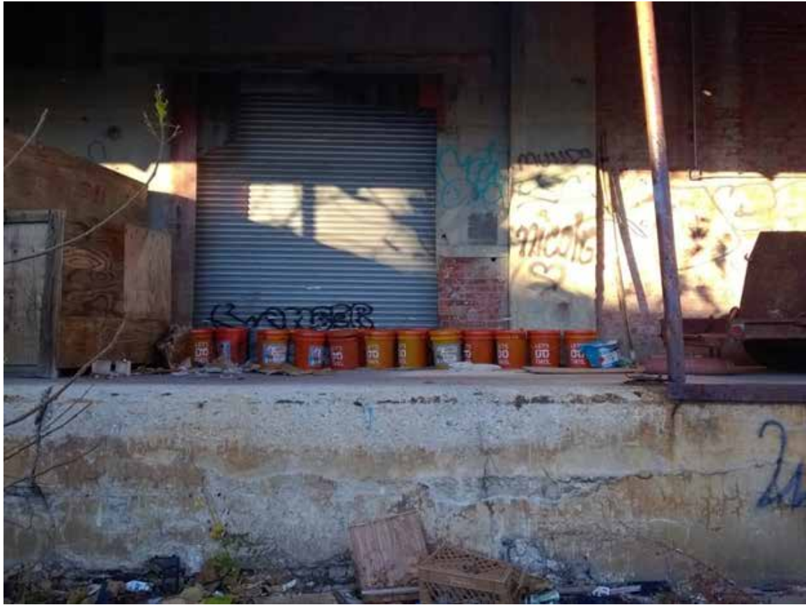
November, Mondo Bongie with EPA (Newark)