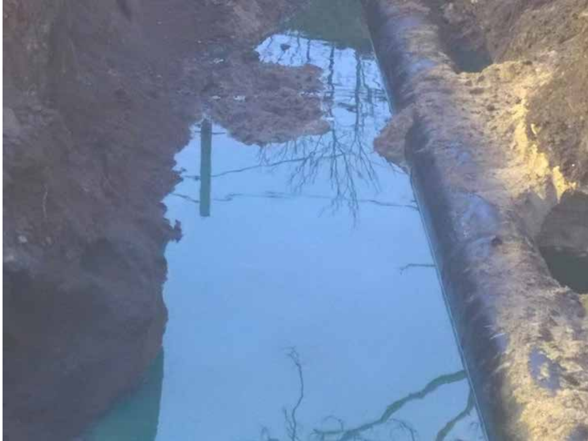
IMTT Pipeline leak