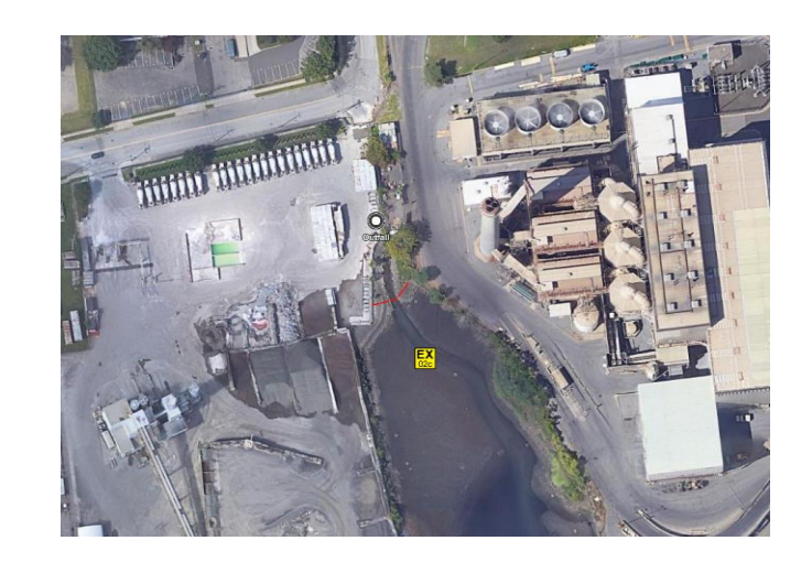
Close-up of EX-02c