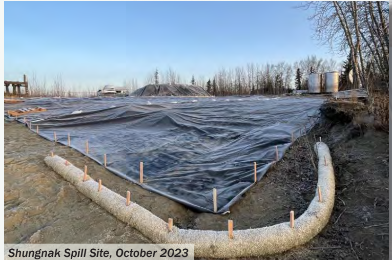
Shungnak Spill Site, October 2023

Borough (MSB) who disposed of over 500 cubic yards of non-hazardous solid waste. The supporting agencies for this site include ADEC, Native Village of Eklutna, MSB, and Eklutna, Inc. who have engaged in multiple previous investigations-and removals of oil drums, abandoned vehicles and other hazardous waste at the site.