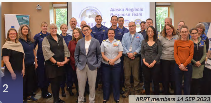
ARRT members 14 SEP 2023