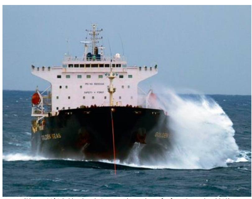
(Photo: M/V Golden Seas being towed to a place of refuge, December 2010)