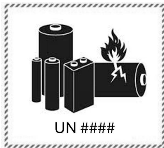
Figure 3 - Mark required for shipping of lithium cells and batteries.