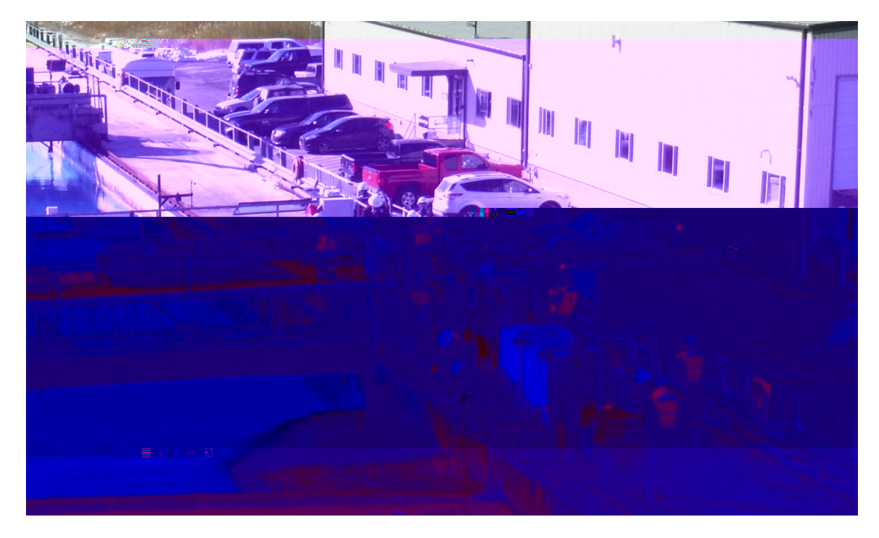
Image 1 : Release of ~ 660 gallons of Bakken Crude Oil at OHMSETT (2/11/2015).