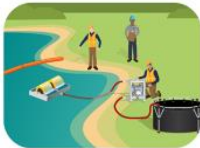
Audit Industry Spill Training and Exercises