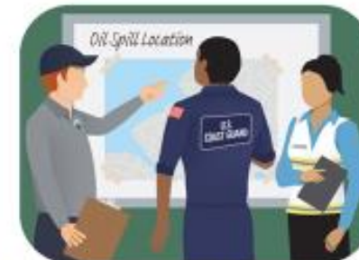
Support the National Response System