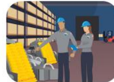
Inspect Response Equipment