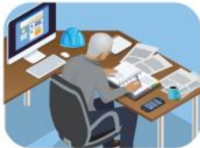
Review Oil Spill Response Plans