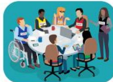
Conduct Government Initiated Unannounced Exercises