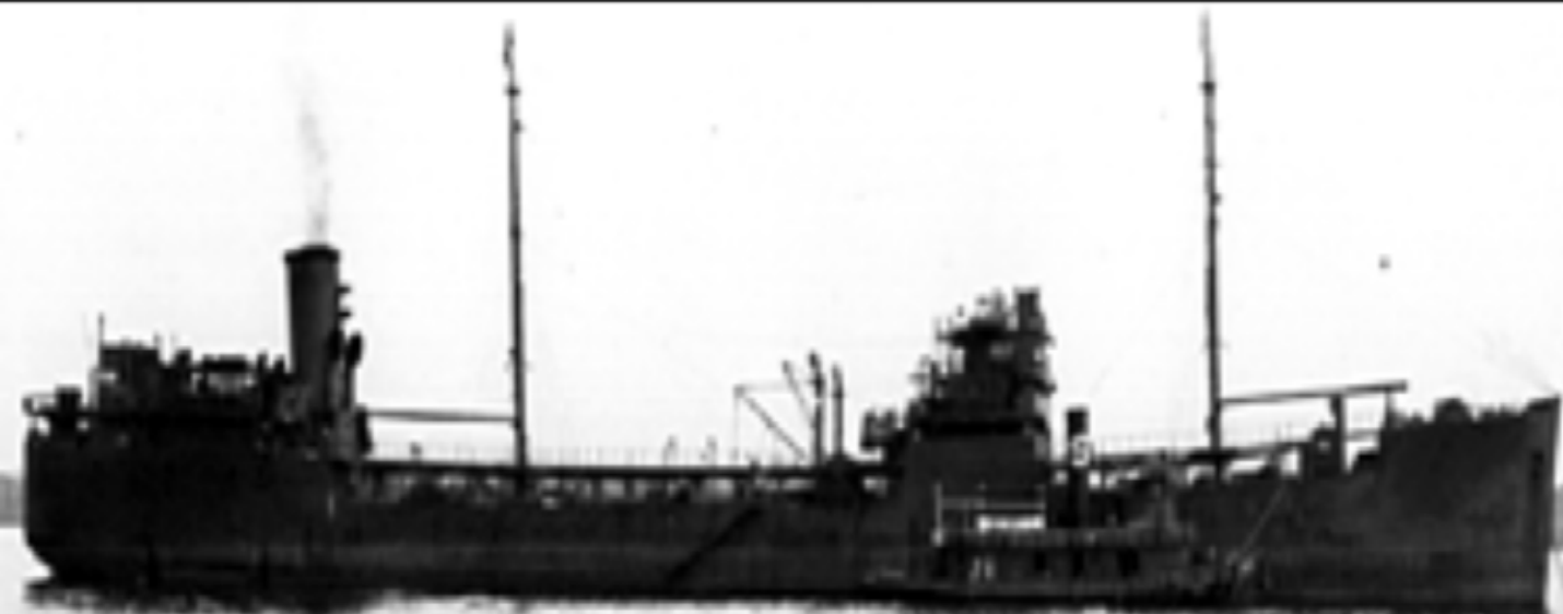
COLMBRIA AG-35 11-8-41 S.A.S.