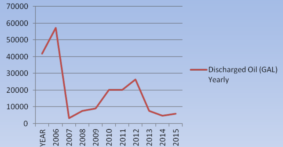
Discharged Oil (GAL) Yearly