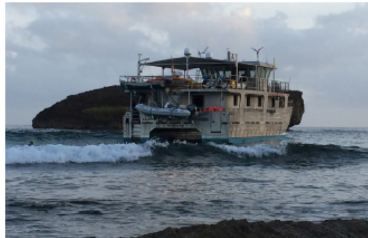
MV Aubi aground on Acropora reefs near Arecibo

The M/V Aubi, a 49' powered catamaran, ran aground on a coral reef on 14 May 2015 near La Cueva del Indio, Arecibo, Puerto Rico, within a newly established Marine Reserve. The hulls of the vessel contained integrated fuel tanks, and the USCG (in coordination with NOAA's National Ocean Service Emergency Response Division & Assessment and Restoration Division and NOAA NMFS Southeast Regional Office & Restoration Center) ordered the fuel removed prior to moving the vessel to minimize the risk of an oil spill.