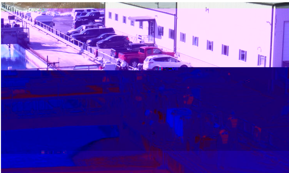
Image 1: Release of ~ 660 gallons of Bakken Crude Oil at OHMSETT (2/11/2015).